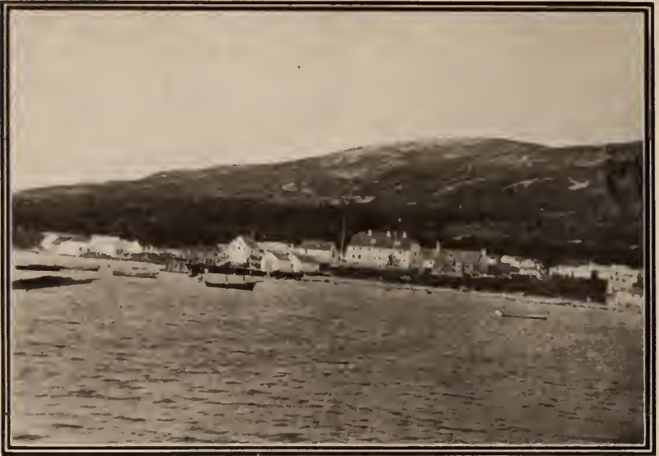
THE MORAVIAN MISSION STATION AT NAIN, LABRADOR